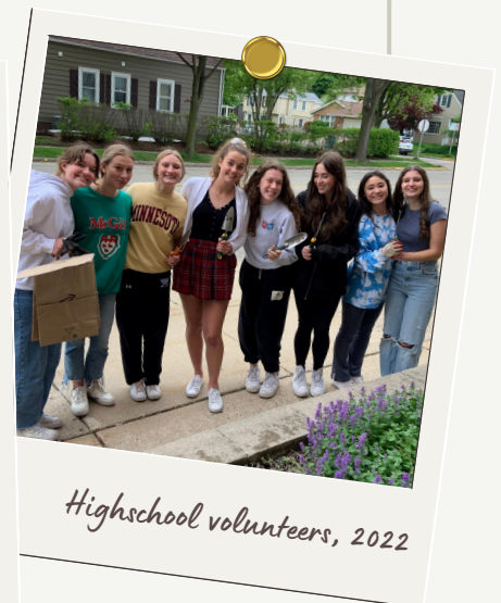
Highschool volunteers, 2022